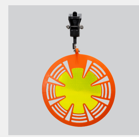
Quickmark Warning Marker Permanent

Summit Power's warning flags are a superior safety solution for visually hazard marking powerlines.