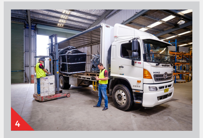
To ensure dependable and hassle-free delivery, we utilize our own transportation fleet- providing seamless and reliable delivery straight to your site or depot.

Once all materials are carefully bagged/boxed,they are then efficiently loaded onto pallets. Following this, we securely strap and wrap the pallets, ensuring they are well-prepared for the loading process, thus guaranteeing a smooth and secure transportation.