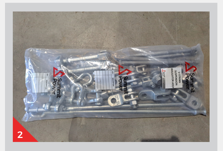
Our kits are packaged in clear, heavy-duty plastic bags. Each bag is labelled with construction details and peg numbers, simplifying the identification and organisation of materials onsite

After we have provided a plan take-off, supply proposal and received order confirmation, our next step involves carefully selecting and assembling all the necessary materials required for each kit required for the project. This includes variable lines.